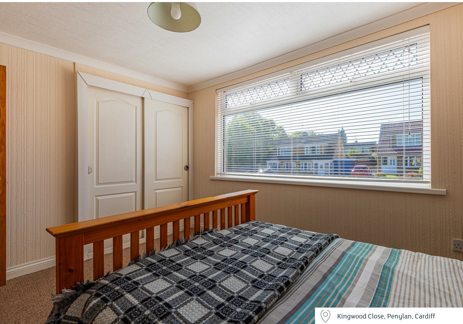
Kingwood Close, Penylan, Cardiff

All measurements are approximate and for display purposes only